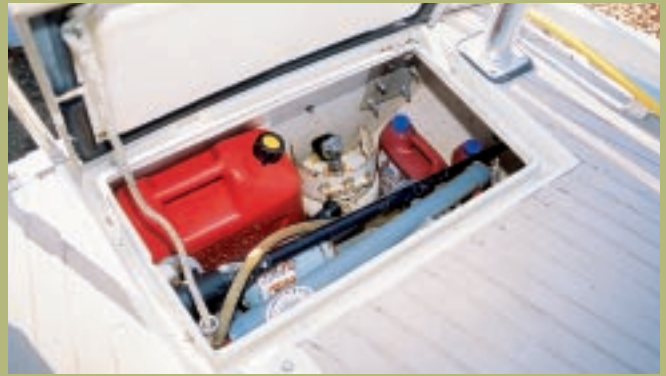
LP gas lockers "shall minimize the likelihood of use as a gear storage locker," according to ABYC standard A-1.

Ideally, the production builder who builds your next boat will be a participant in a recently announced program that has been jointly introduced by ABYC and the National Marine