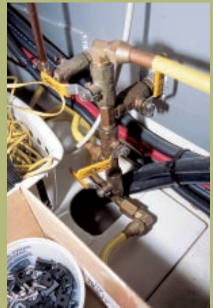
ABYC standards are not a "how-to" to manual. While installations such as this fuel manifold are sloppy and undesirable, the ABYC standards do not specifically prohibit such practices.