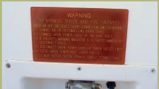
The most commonly requested individual ABYC standard is section E-11, "AC and DC Electrical Systems." This guideline provides a wealth of information about the safe installation of onboard electrical equipment and systems. This image shows an ABYC-compliant placard, which guides the user through safe connection of shorepower cables.